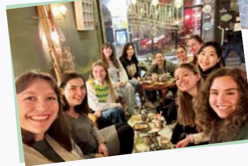
With friends in Lyon, France

Maruyama Friends Club 37th Graduating Class