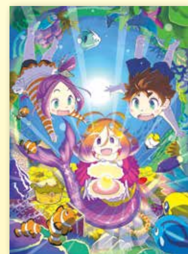
The book "The Most Fun in Japan! Summer Jumbo Mistake-Finding Quiz" published twice a year by Shinyusha.