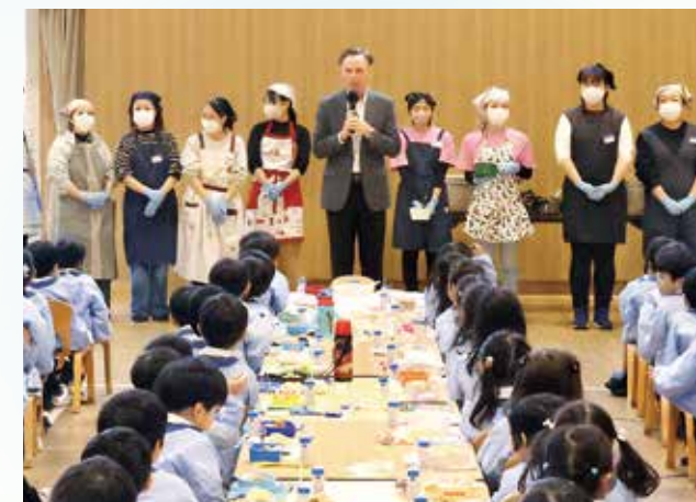
We received a lot of cooperation from our parents last year. (Photo: Thanksgiving Day, with the class mothers who helped us make curry)

For the joyous future of these precious children given to us by God, we hope that the parents and the school staff will build a good relationship of trust and cooperation with each other. We look forward to working with you again this school year.