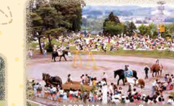
throughout the Years