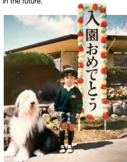
On the day of the entrance ceremony. At the time there was an Old English Sheepdog named Candy at Takamori.

I entered MEXT last April, and my current work involves preserving cultural assets in the Cultural Properties Division of the Agency for Cultural Affairs. As of last December, I am also working with the Cabinet Secretariat's Future of Education Creation Council. What led me to my current job was my study of philosophy at graduate school, where I learned the depth and joy of learning, and it gave me a desire to see things that are important and yet not visible to the eye, like the concepts of philosophy, brought to reality in the social system. Through my educational training, I also saw the appeal of the role of a teacher and the