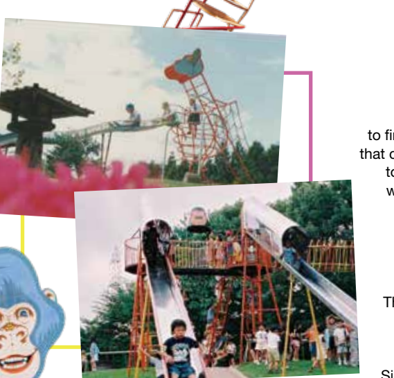
The higher parts of the slide are made into tunnels with clear walls to prevent falls and to enable he teachers to ensure safety from the outside