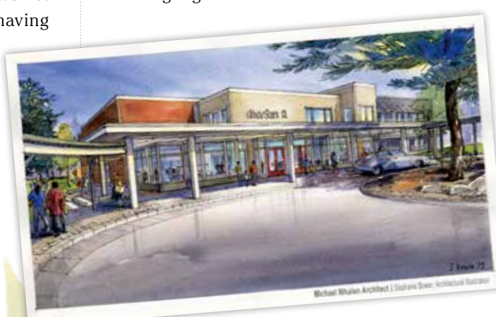
Illustration of new Maruvama hall a place where MeySen and the local community ca work as one to raise our childrer

We hope that many parents and alumni will join us. It does not matter how small or large the donation. We look forward to celebrating the completion of the hall something made possible by all of us working together.